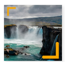
Webinar: The new DB funding code - the good, the bad and the (potentially) ugly