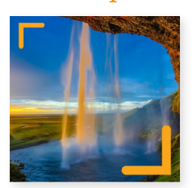
Webinar: The new DB funding code - a whole new world for covenant advice